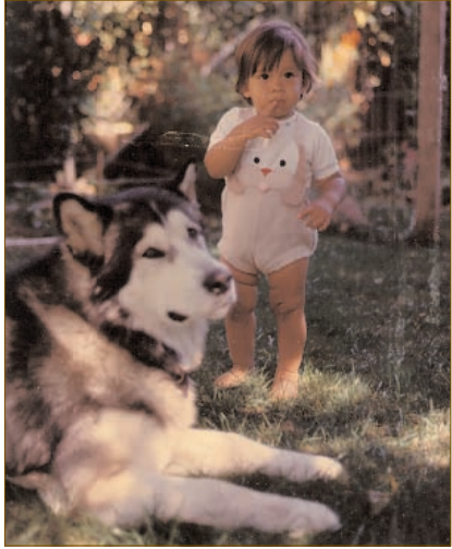
Children and puppies (or dogs) should never be left together unsupervised.

First, invite over only well-trained children. Supervise the children at all times. I repeat, supervise the children at all times. (Later on, puppy classes will offer a wonderful source of