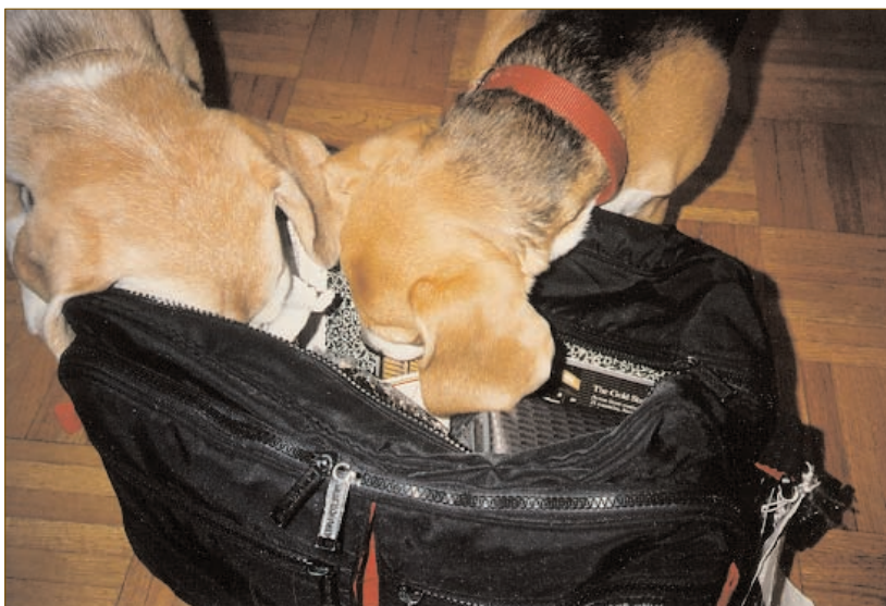
Beagles just begging to "unpack" a visitor's unattended luggage

Most doggy "disobedience" and wanton house destruction occurring in the owner's absence has nothing to do with separation anxiety. In fact, separation relief might be a more precise and descriptive term. The dog chews, digs, barks, and soils the house only when the owner is absent because he has learned it would be foolhardy to indulge in these pastimes when the owner is present. Owner-absent misbehavior is an indication that the owner has tried to suppress normal and natural dog behaviors with punishment, rather than teaching the dog how to behave—namely, how to express his basic doggy desires in an acceptable fashion. Often the term separation anxiety is an excuse for a dog who is simply not yet housetrained or chewtoy-trained.